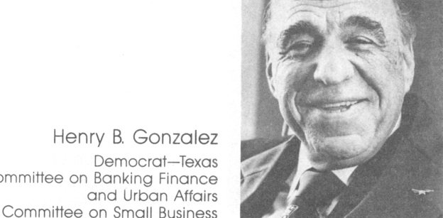
Committee on Banking Finance Committee on Small Business