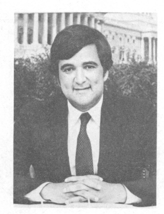
Bill Richardson Democrat—New Mexico Committee on Energy and Commerce Select Committee on Aging Committee on Veterans' Affairs