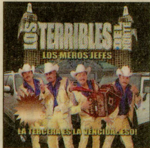
LOS TERRIBLES DEL NORTE