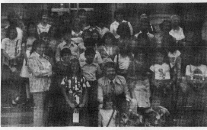
St. Cyril and Methodius School 5th graders.