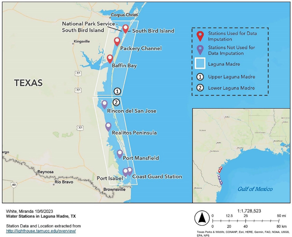
Fig. 1. Map of water stations located in Laguna Madre, TX. Stations that were used for the imputation process are labeled in red, while the remaining stations that are not used for the newly gap-filled dataset are labeled in purple.